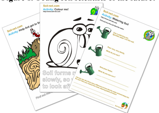
Figure 3. Soil-net.com-classroom soil activities.