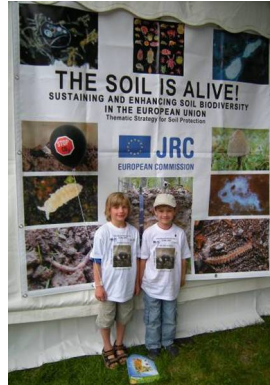
Figure 2. Soil animals always fascinate our youngsters.