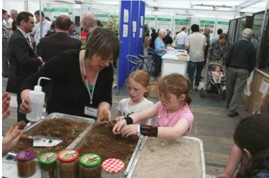
Figure 1. Young soil scientists of the future?

The authors of this paper have all taken part in exchanging our knowledge to wider society. We have found this to be very satisfying, although there is an associated need to develop a resistance to the fear factor of ‘getting it wrong’. If the language and message is passed across in the right way, it has been found that people are genuinely interested in this subject area. However that should not be the main reason for increased activity; many report our planet to be at an important point in its history and we also have a moral obligation to inform society and in particular the younger generations of our most important natural resource - our soils.